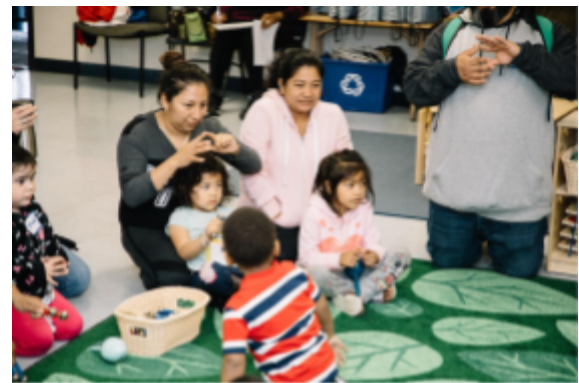
Playgroup participants at circle time

Caregivers have what they need to provide quality care: # and locations of agencies supporting informal care providers