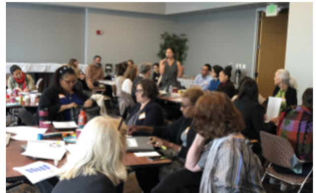
Task Force participants discussing how to use EDI data

Resources are allocated to mitigate implicit bias (i.e. being culturally and linguistically responsive through resources)