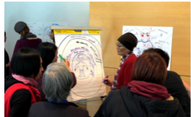
OUSD and Head Start early childhood educators at a ROCK Compassion Fatigue training.

# of early educators that have been trained in and apply trauma-informed care